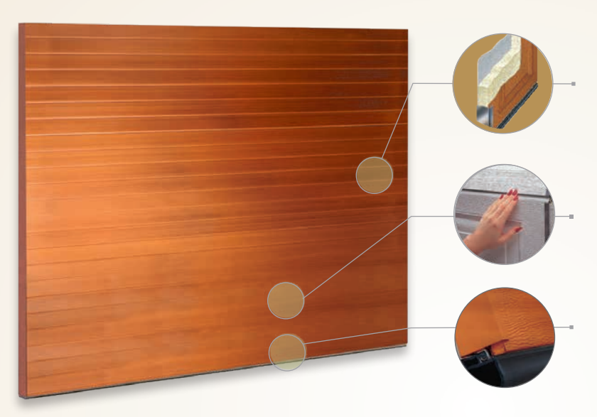
Model 984 7' high, Horizontal V-groove, Red Oak stain